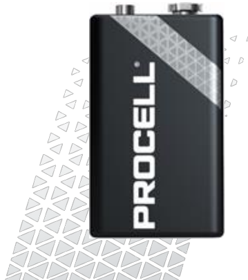
size: 9V (6LR61) PC1604